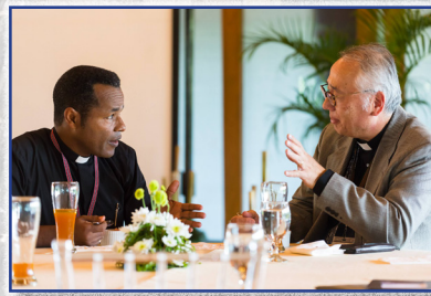
Lutheran Leadership Development

We are a growing worldwide association of established confessional Lutheran church bodies that proclaim the Gospel of Jesus Christ on the basis of an unconditional commitment to the Holy Scriptures as the inspired and infallible Word of God and to the Lutheran Confessions contained in the Book of Concord as the true and faithful exposition of the Word of God.