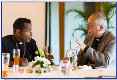
Lutheran Leadership Development

We are a growing worldwide association of established confessional Lutheran church bodies that proclaim the Gospel of Jesus Christ on the basis of an unconditional commitment to the Holy Scriptures as the inspired and infallible Word of God and to the Lutheran Confessions contained in the Book of Concord as the true and faithful exposition of the Word of God.